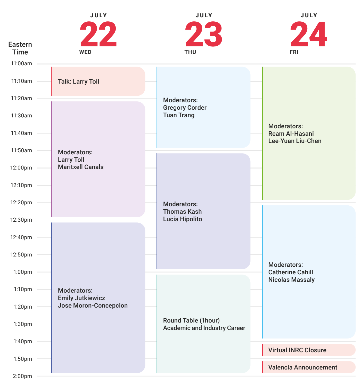
INRC Welcome | Goodbye, Opioid Signaling, Reward-Addiction, Pain-Analgesia, Kappa, Round Table